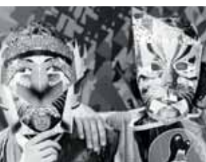
ASSUME VIVID ASTRO FOCUS