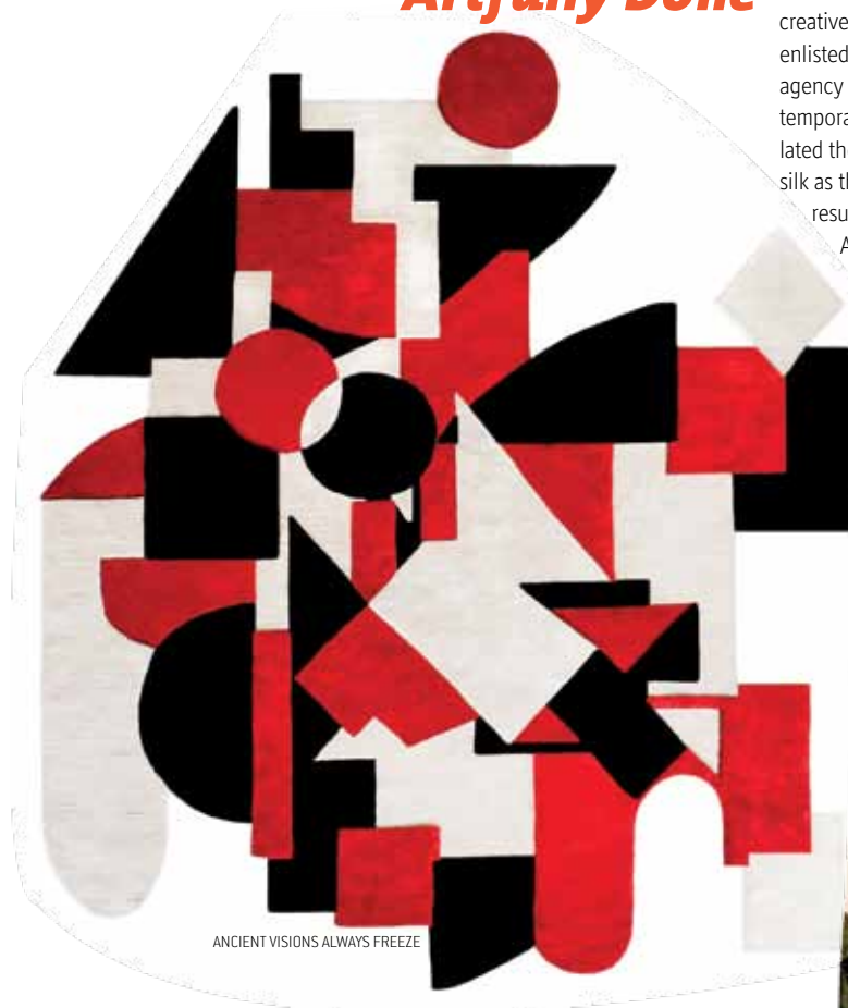
ANCIENT VISIONS ALWAYS FREEZE