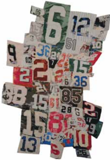
1-234-567-8910 by Richard Prince