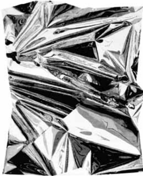
Untitled by Anselm Reyle